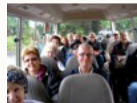
Passengers in bus

Departure: 9.00am, 10.00am Cruise ship days. Returns 1.45pm & 3.10pm.