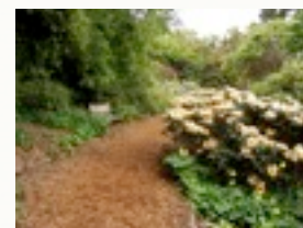
Dunedin Botanical gardens

Departure: 9.45am, Cruise days. Returns 1.45pm & 3.10pm.