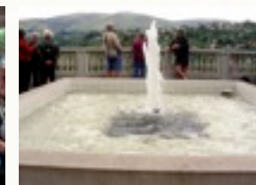
Fountain in the Mediterranean garden.