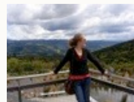
The viewing deck at Orokoni

Departure: 9.45am, Cruise days. Return aprox 4.00pm (All prices include GST)